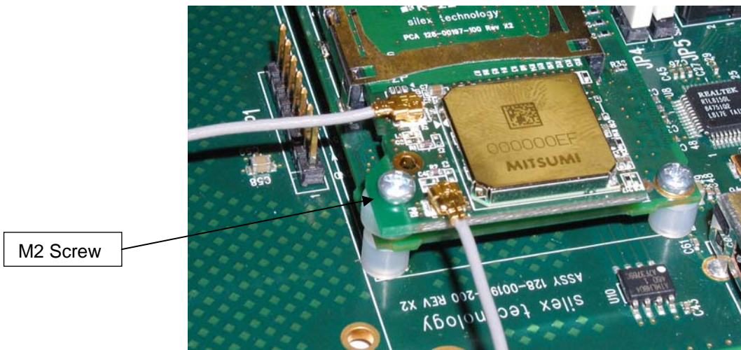
Figure 3. Securing the SX-SDCAG